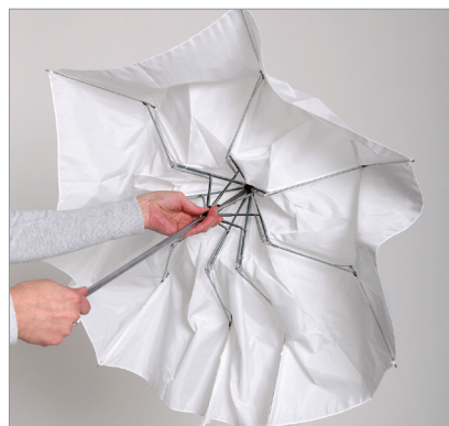
Translucent TriFold Umbrella - 2127