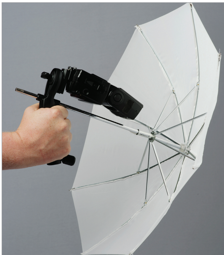
Brolly Grip with Translucent Umbrella 50CM (20") - Available separately or in Brolly Grip Kit 2126

The Brolly Grip is also available to purchase as a kit with the Translucent 50cm (20") Umbrella, creating a compact, quick to assemble 'shoot through' solution for photographers.