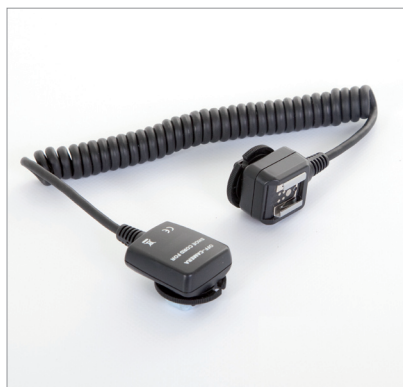
1m Off Camera Cord - Nikon 9901 / Canon 9902